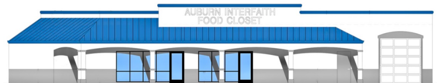
Building Location: 1788 Auburn Ravine Road

The Pathway of Recognition will be built into the walkways leading to the building and under the building portico, as well as the plaza area. Premium sites will be limited to high traffic sections of the walkway.